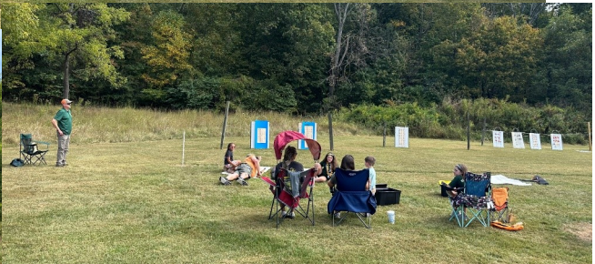
Family Fun Day 2023